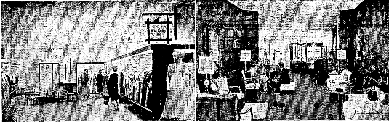
ONE OF THE NEW DEPARTMENTS included in the remodeling and expansion of Embry's is the Miss Embry Shop (left). This department features fashions designed specifically for the young married or the career girl. In the picture at the right, the new Designer Show Salon can be seen at the front. In the rear is the contemporary shop, catering to the younger tastes.