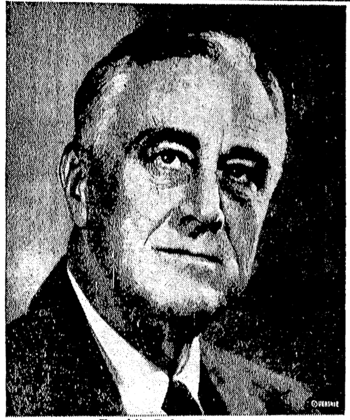
Franklin Delano Roosevelt

WASHINGTON, April 12 (AP)—Accession of Vice President Truman to the presidency moves Secretary of State Steffinius up to next in line for the office.