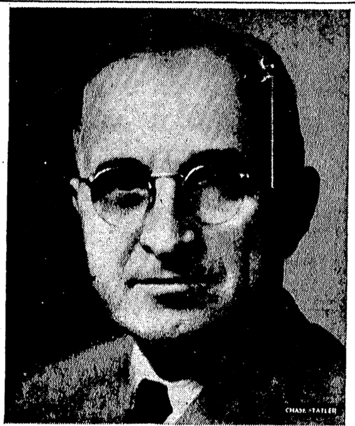
Harry S. Truman